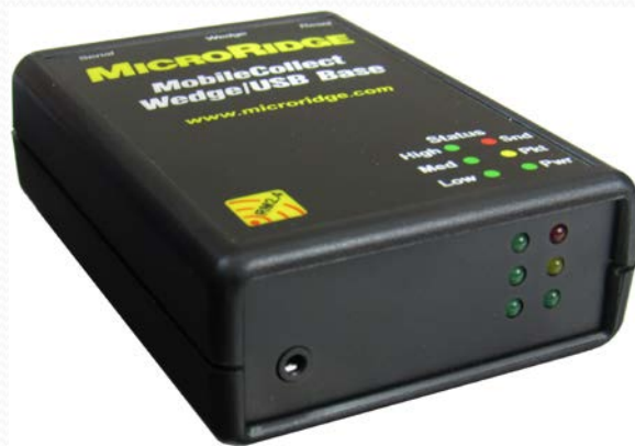
BACK PANEL VIEW